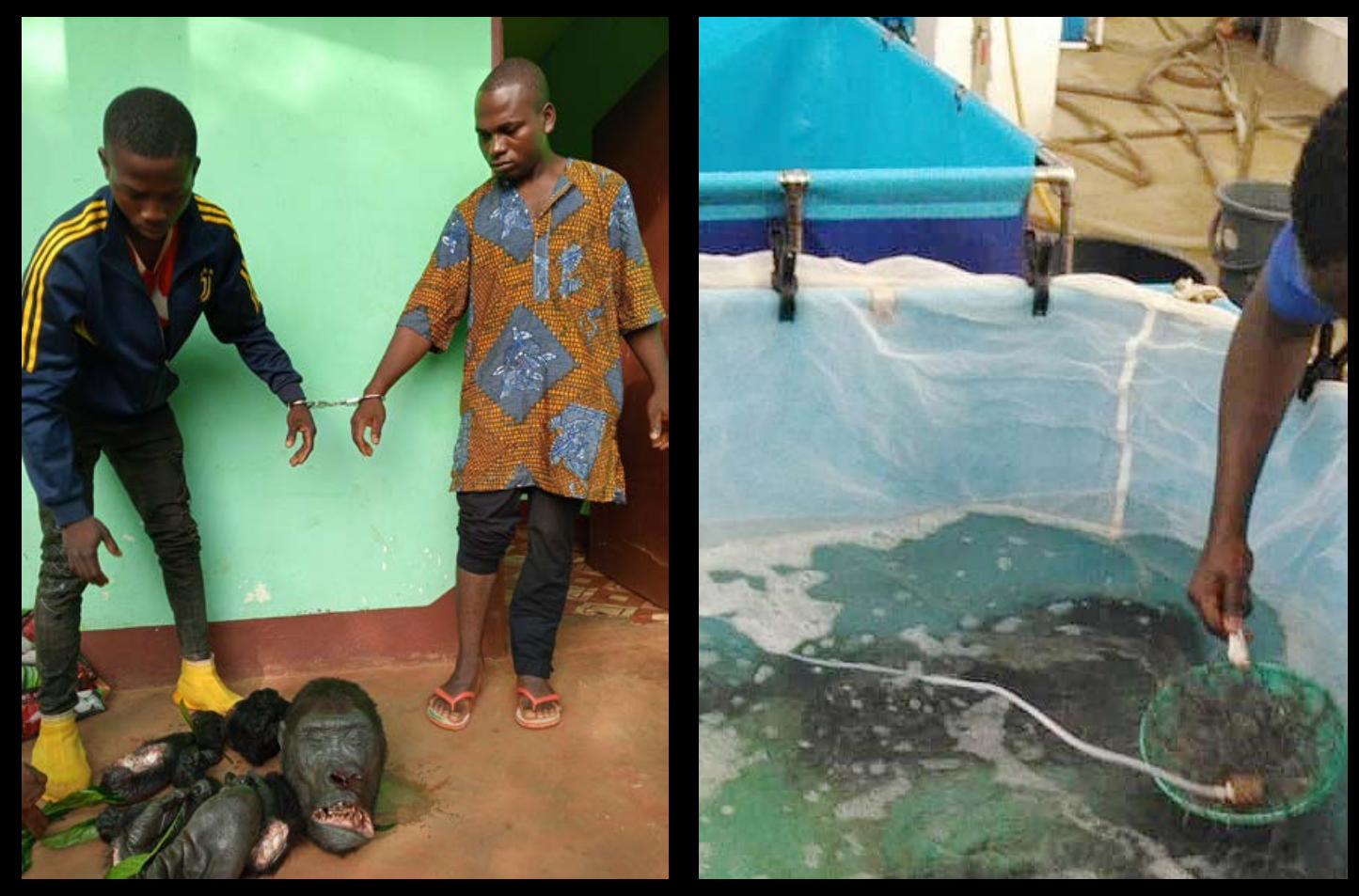
2 traffickers arrested with body parts of 2 killed gorillas in Camer- A Chinese national arrested in a glass eels trafficking crackdown oon.