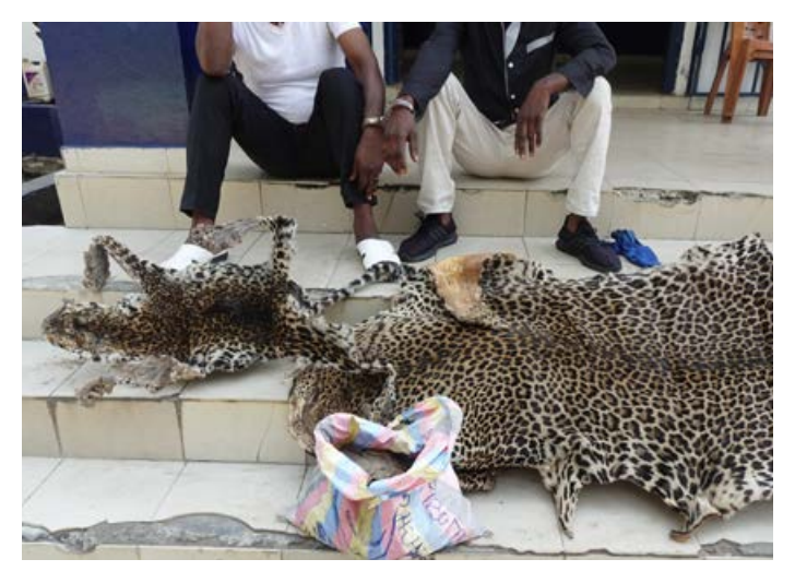
2 traffickers arrested with 2 leopard skins and some pangolin scales in Congo.

was done by the Legal Team on the ground. They were reported to have "escaped". The hunt is ongoing, and the corruption incident is under investigations.