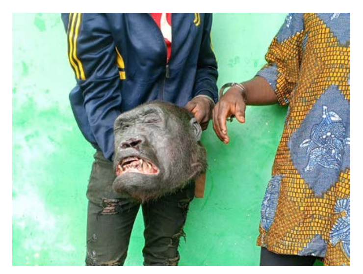
2 traffickers arrested with body parts of 2 killed gorillas in Cameroon.

2 traffickers arrested with body parts of 2 killed gorillas in Cameroon. The parts that included heads and limbs had blood still dripping indicating the gorillas were recently killed. The two were specialised in poaching and trafficking in great apes. Due to corruption, the two disappeared right after a jail visit that