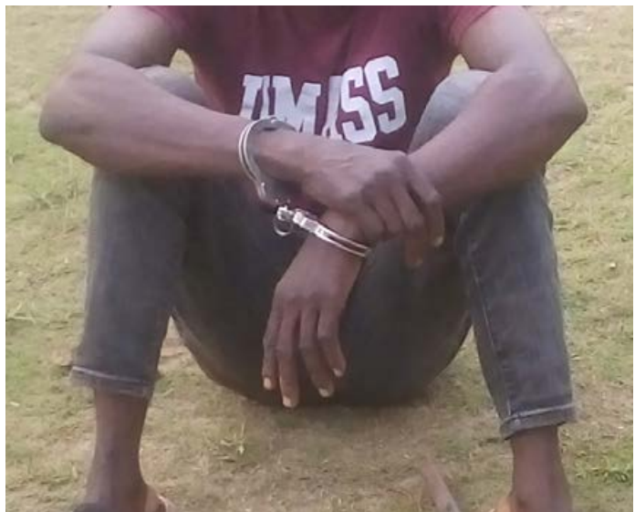
A leopard skin trafficker arrested with several pieces of wildlife and a rifle in Cote d'Ivoire.

A leopard skin trafficker arrested with several pieces of wildlife and a rifle in Cote d'Ivoire. Following the arrest of two leopard skin traffickers last month, a follow up investigation led to his arrest. During the operation, he physically resisted arrest but was quickly subdued. He is the supplier of wildlife contraband to several other traffickers.