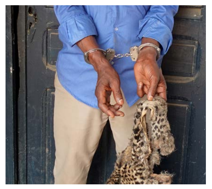
A trafficker arrested with a leopard skin in Congo.