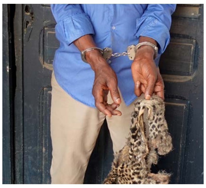
A trafficker arrested with a leopard skin in Congo.

A trafficker arrested with a leopard skin in Congo. The logging company worker travelled a long distance from the north end of the country. On arrival at his destination he boarded a motorcycle with the