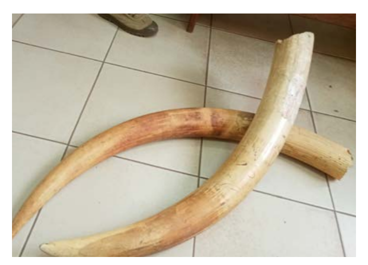
3 traffickers arrested with 2 elephant tusks in Cameroon.

3 traffickers arrested with 2 elephant tusks in Cameroon. A retired Colonel of the Ministry in charge of Wildlife that has also been in charge of several National Parks was among them. The Colonel that abused his position has been charged and forwarded to court with the others. The traffickers concealed the elephant tusks in the boot of a car. They refused to open the boot in an attempt to foil the arrest operation.