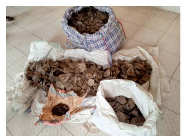
2 traffickers arrested with 81 kg scales of giant pangolins in Congo.

2 traffickers arrested with 81 kg scales of endangered giant pangolins and 24 nails in the north of Congo. One is a priest while the other is a worker contracted by city council to lay fiber optic cables around villages - both used their positions to trade