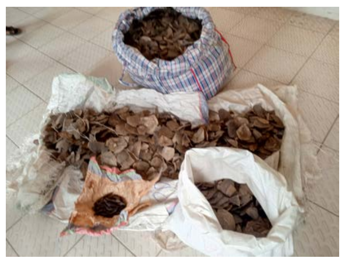
2 traffickers arrested with 81 kg scales of giant pangolins in Congo.

hid the scales in a car tyre to evade control by wildlife officials while moving the scales around. They ran a network of several smaller traffickers.