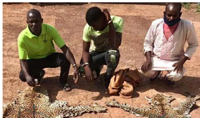
3 traffickers arrested in Senegal with 2 leopard skins.

2 traffickers arrested with 4 tusks in Uganda. The 4 large ivory pieces that weighed 25kg were wrapped in polythene and concealed inside a bag they took to the place of transaction. One of the traffickers is a renowned middleman for the ivory trafficking network.