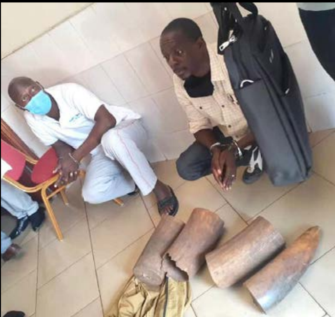
2 traffickers arrested with 4 tusks in Uganda.