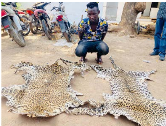
A trafficker arrested with 2 leopard skins.