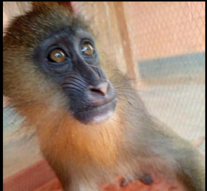
A trafficker arrested in Cameroon with a baby mandrill.