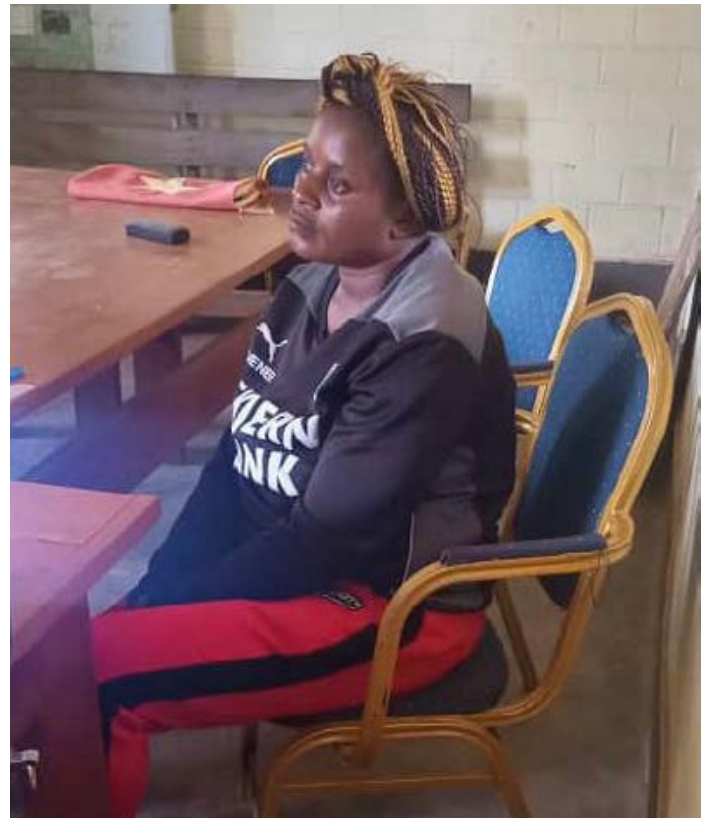
A trafficker arrested with 60kg of pangolin scales.