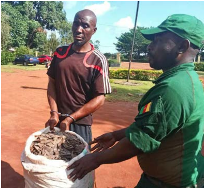
A trafficker arrested in Cameroon with 60kg of pangolin scales.

A trafficker arrested in Cameroon with 60kg of pangolin scales. This seizure is a mere snapshot of the regular two-weeks activity of the trafficker. This one sack represents the killing of up to 300 pangolins (depending on the species). He is an experienced pangolin scales trafficker who posed as a hawker in second hand dresses. He bought pangolin scales from smaller traffickers and poachers he activated in several localities.