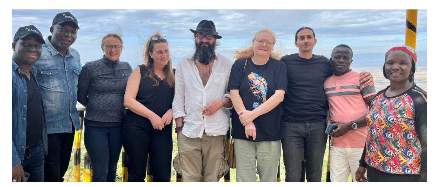
The EAGLE NETWORK – LAGA, PALF, EAGLE Togo, EAGLE Senegal, EAGLE Côte d'Ivoire, EAGLE Uganda, EAGLE Guinea Cameroon, Congo, Togo, Senegal, Côte d'Ivoire, Uganda, Guinea November 2024 | 2

from Senegal, Togo, Congo, Uganda and Cameroon, 4 Central Coordination Unit members and the EA-GLE Director. A broad range of issues affecting the network were discussed during in-depth sessions working together to improve our way of work, growth and planning. Time with nature connected better the EAGLE leaders to the wildlife we are fighting to protect and to each other.