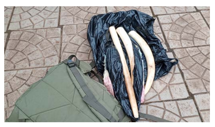
3 ivory traffickers including two military officers arrested with three and a half tusks in Cameroon.

The EAGLE meeting of 2024 took place in Kenya - a week of fruitful discussions and bonding of activists managers. The meeting was held November 1 - 7 and brought together 9 EAGLE managers - Coordinators